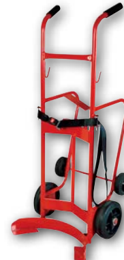
Poly Drum Truck - 4 Wheel Truck/Dispenser