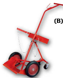
(B) Standard Welding Cylinder Truck