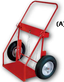
(A) Standard Welding Cylinder Truck