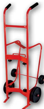
Steel Drum Truck - 4 Wheel Truck/Dispenser