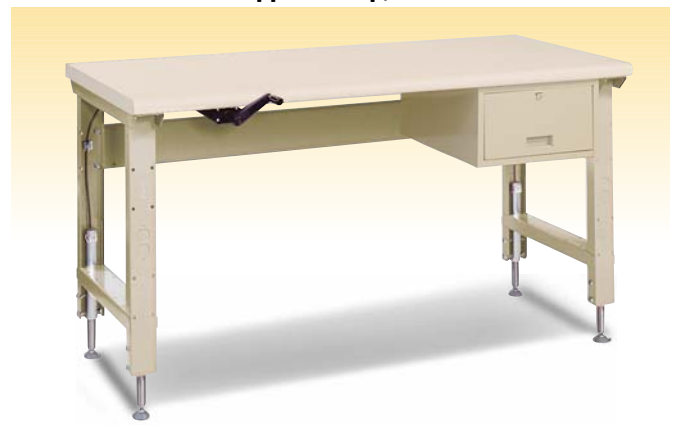
Ergo-Bench® Work Station with Stringer & Drawer