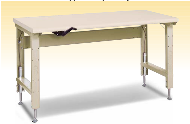
Ergo-Bench® Work Station with Stringer