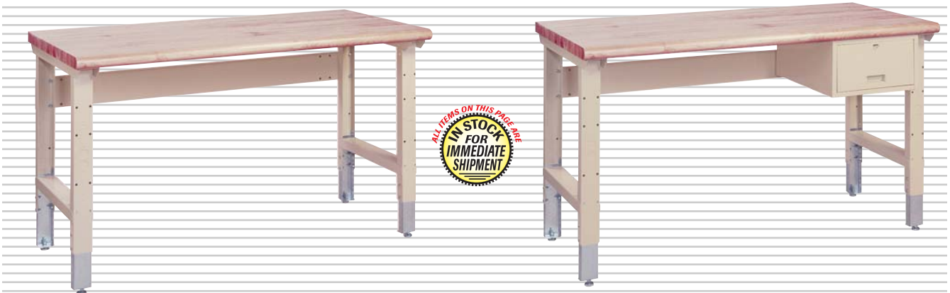
Work Bench with Stringer