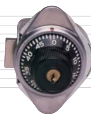
Built-in Master-Keyed Combination