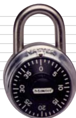
Master-Keyed Combination Padlock