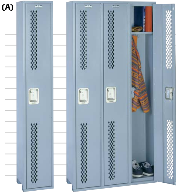
(A) Starter Order one No. 7110AWDP and receive This one section, one frame wide (one locker opening).