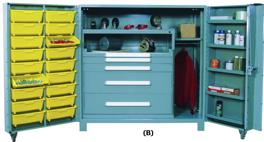
400 lb. capacity roll-out shelf

*Interior drawer dimensions, all drawers are 25⅞"d