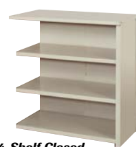
4-Shelf Closed Add-On