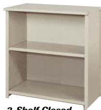
3-Shelf Closed Starter