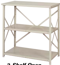
3-Shelf Open Starter