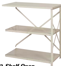
3-Shelf Open Add-On