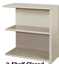
3-Shelf Closed Add-On